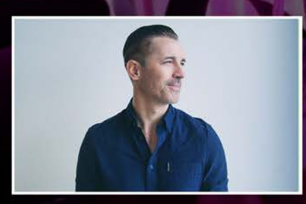
ROYAL WOOD OCT 2, 2021 | SINGER-SONGWRITER

Drawing on a wide range of influences, their unique sound evokes the rich musical heritage of their New Orleans home.