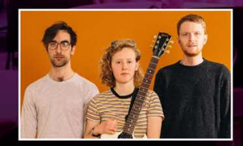
BAD BAD HATS NOV 18, 2021 | INDIE ROCK

Experience this Canadian singer's emotional lyrics, beautiful melodies, and soulful vocals.