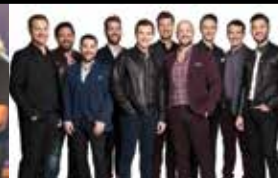
THE TEN TENORS: LOVE IS IN THE AIR