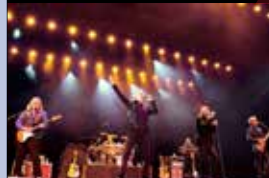
THREE DOG NIGHT