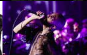
PORTLAND CELLO PROJECT: PURPLE REIGN

"County Materials is proud to support the performing arts in North Central Wisconsin. We believe the arts offer very positive and practical benefits for our community. They inspire each of us by fostering creativity and beauty. They improve well-being and express our values, and even build bridges between cultures. Most importantly, the arts are fundamental to creating a healthy and sustainable community, strengthening it socially, educationally and economically."