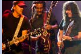
CLASSIC ALBUMS LIVE: AC/DC'S BACK IN BLACK